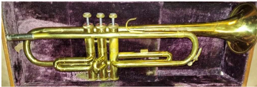
Match from 1963 Lignatone catalog (Amati)